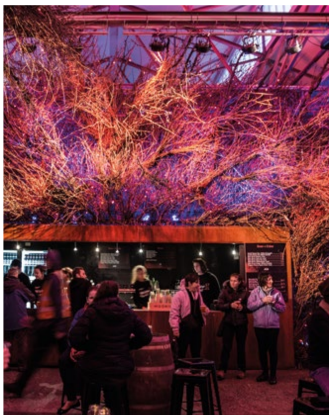
CULINARY STORM: The City of Hobart – Dark Mofo Winter Feast this year, 15–19 June.

City of Hobart buildings and significant places will be lit red as part of the festival, which will take place at the Macquarie Point "Dark Park", Princess Wharf 1, the Blacklist party in the city centre and other selected venues throughout Hobart and Tasmania. ■