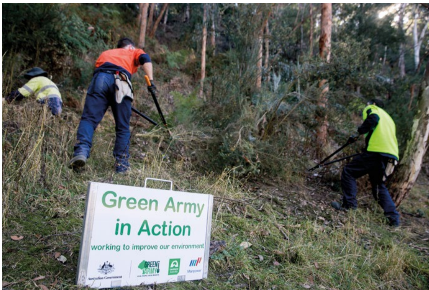
TEAMWORK: Green Army participants hard at work in the Hobart Rivulet Park.