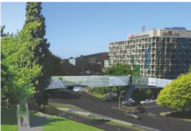
FREE FLOW: Work is scheduled to improve pedestrian movement across the Brooker Highway. Image: Terroir.

For a full list of major projects and the years they will begin, visit hobartcity.com.au/transforminghobart ■