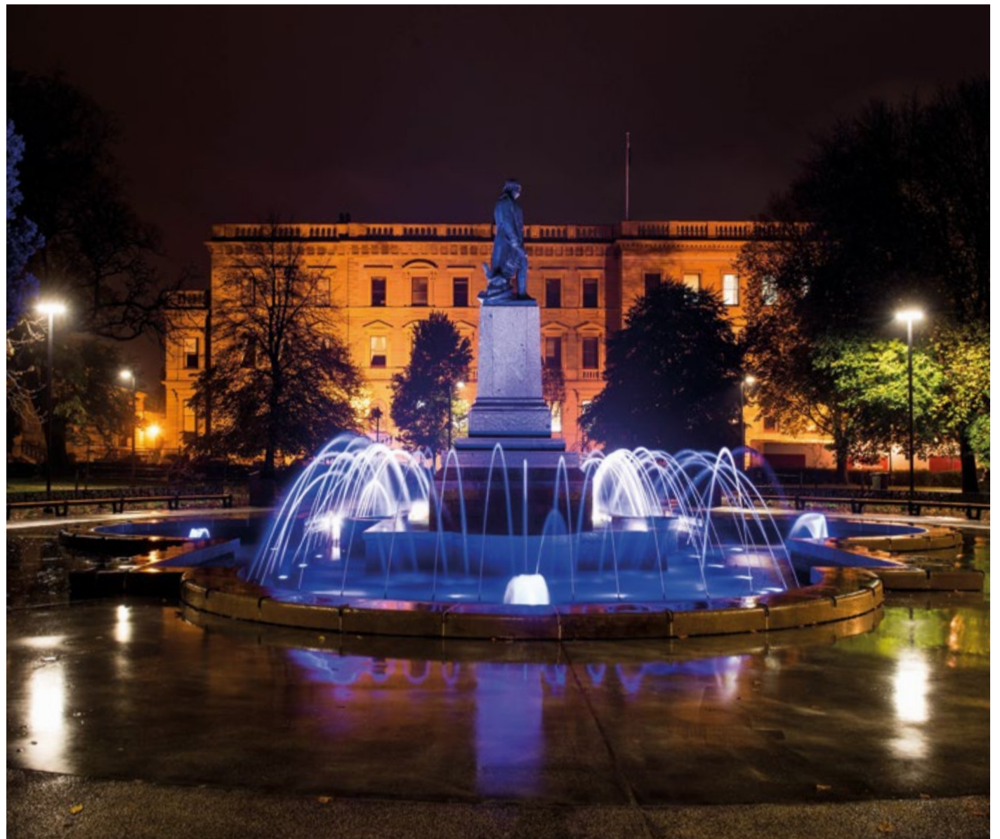
STANDING TALL: New lighting has been installed to showcase the historical features of Franklin Square and improve public safety.