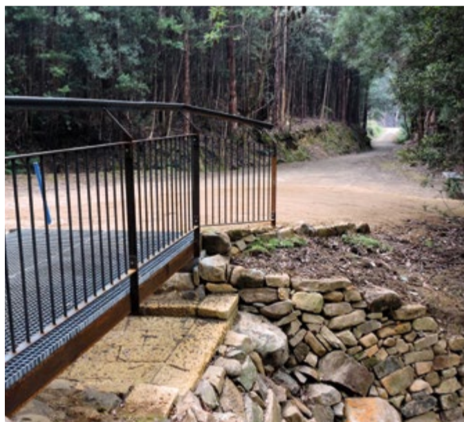
STONE WORK: As well as the new bridge and trackwork, the historic stone troughs and spillway have been repaired.

Why not take a look for yourself? The Greater Hobart Trails website contains information on all the tracks within the City of Hobart: greaterhobarttrails.com.au ■