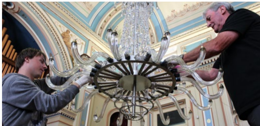
SPARKLING: The Town Hall ballroom chandeliers are cleaned every two years.