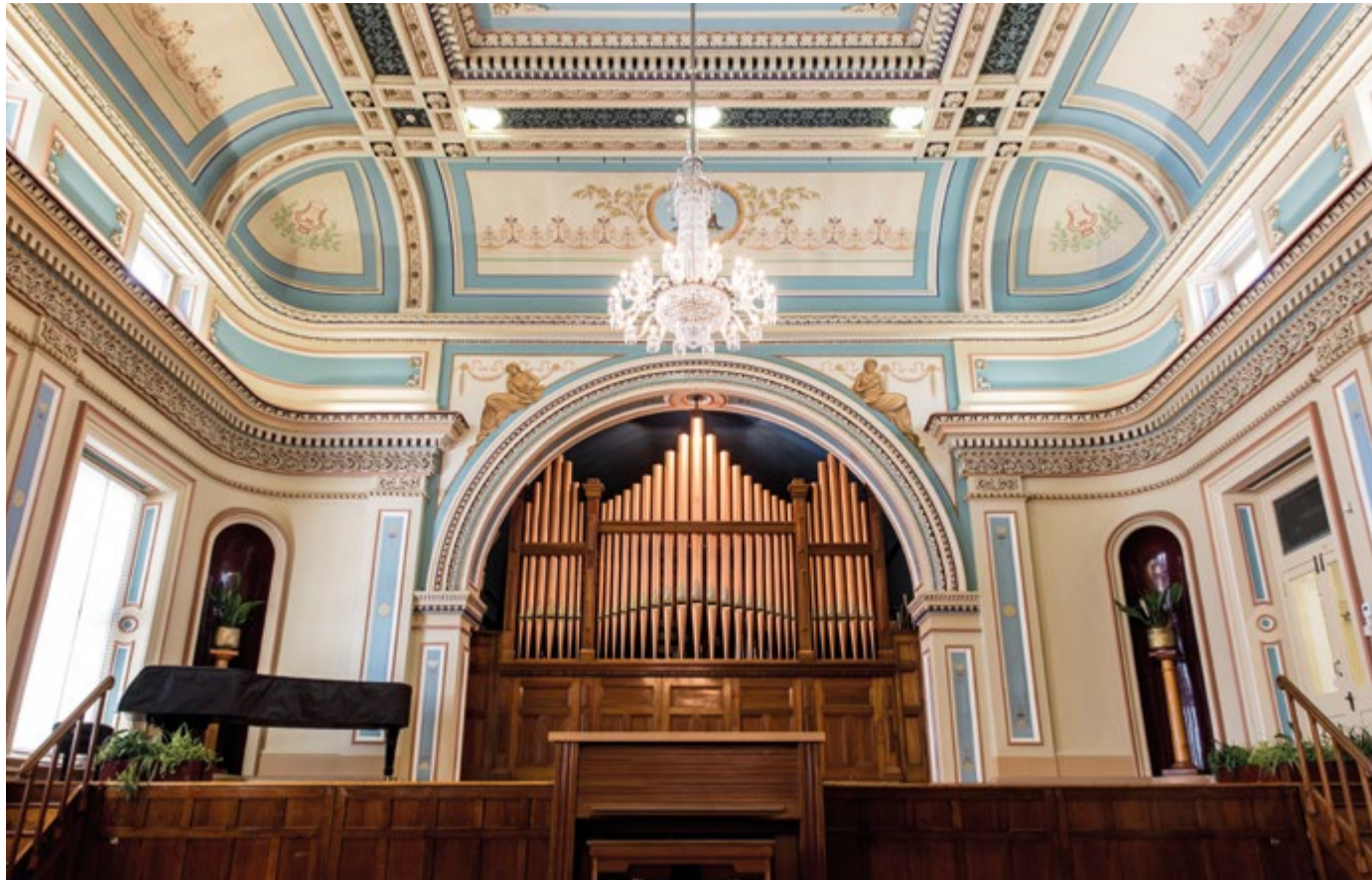
PIPE MUSIC: The Town Hall organ has been rebuilt twice since it was first installed in 1870.

The Hobart Town Hall turns 150 this September and the birthday celebrations will include an open day of music, food, historical tours and, of course, a cake.