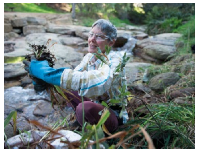
GIVING BACK: Bushcare groups help the City of Hobart look after bushland and reserves.

To stay informed about the 150th anniversary celebrations and events, keep an eye on hobartcity.com.au and follow the Town Hall Facebook page: facebook.com/hobarttownhall ■