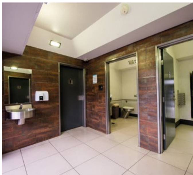
WELCOMED WCs: Modern new toilet blocks cater to locals and visitors.

The Public Toilet Strategy 2015–2025 has earmarked $12.6 million to bring the City's toilets up to date. ■