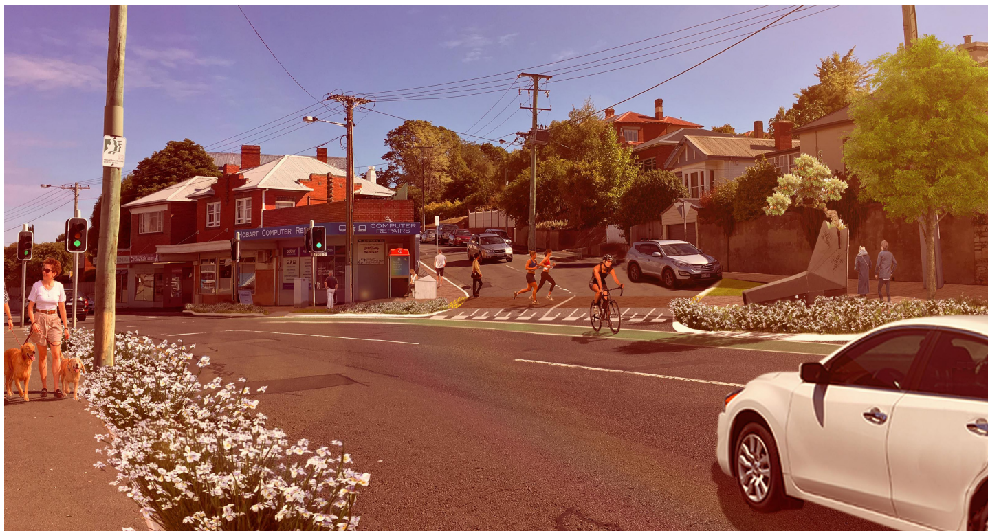
Artist's impression of streetscape upgrade including Hybrids – public artwork by Matt Drysdale.